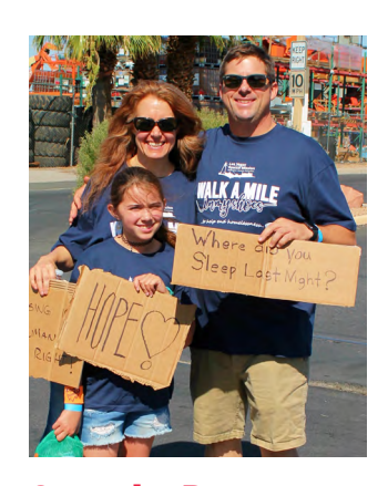
Save the Date to