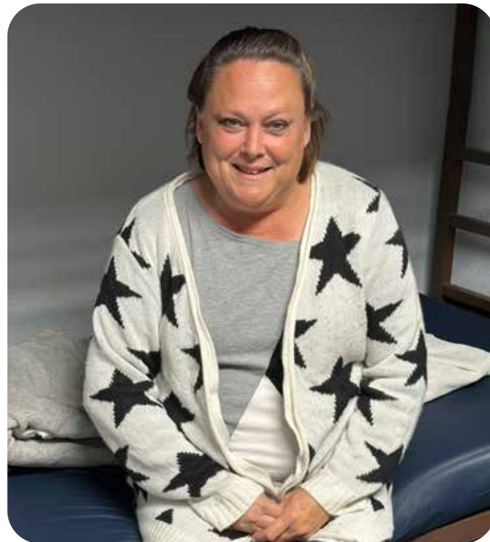
Thank you for helping your neighbors find their way!