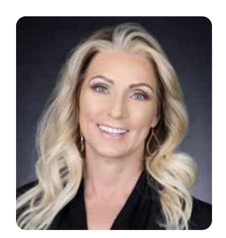
Thank you for bringing the warmth of God's love to struggling neighbors this winter.

Welcome to our family of supporters! We are so happy you've joined us.